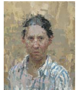
Anne Gale Self Portrait With Blue Stripes , 2007. Oil on masonite, 14" x 11".