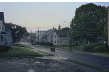
Gregory Crewdson Untitled (Kent Street) , Summer 2007. Archival inkjet print, 58 ½" x 89 ½". Courtesy of the artist and Lühring Augustine, New York.