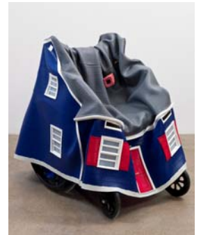
Brian Tolle Old Glory , 2008. Wheelchair, platinum silicon rubber, 36" x 24" x 36".