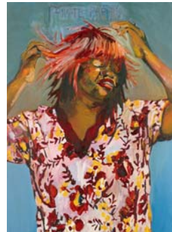
Beverly McIver Private Party , 2008. Oil on canvas, 36" x 48".