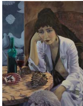
Hilary Harkness Alice at Loggerheads , 2008-09. Oil on aluminum, 12 ¼" x 9 ½".