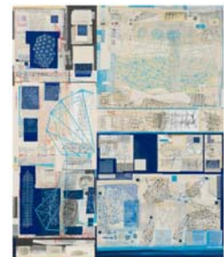
Stephen Talasnik Modern Measurement , 2008. Collage on panel, 72" x 60".