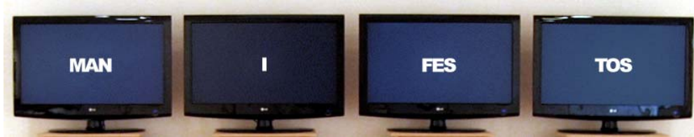
Charles Gaines Manifestos , 2008. Video/sound installation, 20' across. Courtesy of Kent Gallery, New York.

February 13, 2009 – Over 100 paintings, photographs, sculptures, installations, and works on paper by 30 contemporary artists will be exhibited at the galleries of the American Academy of Arts and Letters on historic Audubon Terrace (Broadway between 155 and 156 Streets) from Thursday, March 12 through Sunday, April 5, 2009. Exhibiting artists were chosen from a pool of more than 170 nominees submitted by the 250 members of the Academy, America's most prestigious honorary society of architects, artists, writers, and composers.